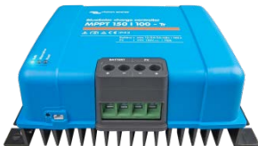
Solar Charge Controller MPPT 150/100-Tr