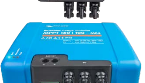
Solar Charge Controller MPPT 150/100-MC4